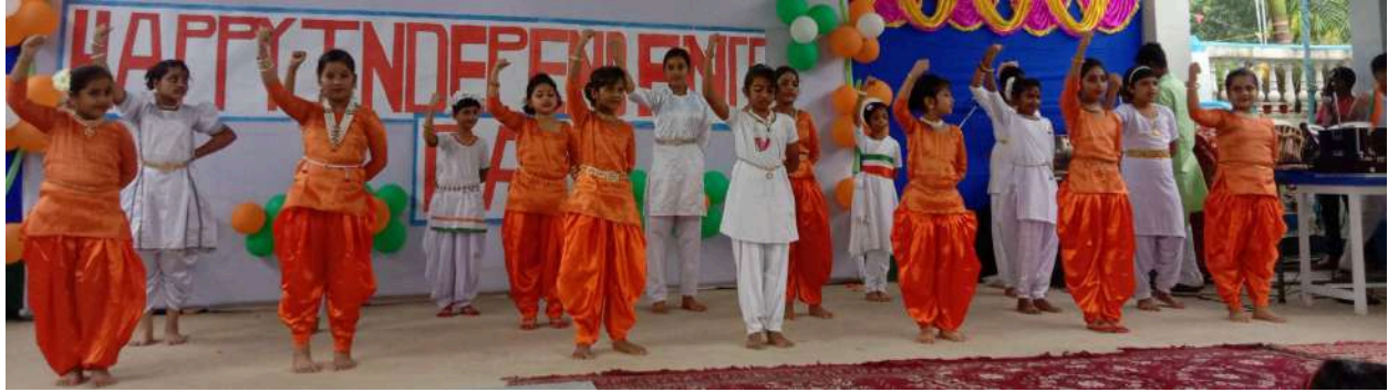
Dance performance by Grade 3 & 4 students

Addressing the audience, the Principal of the school shed the light on the theme of this Independence Day 'Nation First, Always First'. He said how in each phase the nation manifested this theme by dedicating itself towards a special mission. First, in the pre-Independence stage, Nation First became manifested through complete dedication towards freeing the nation from the British rule and in the post-Independence stage, the theme became manifested through complete dedication towards nation-building in the educational sector, agriculture sector, health sector, etc. Now, we are in the 3rd stage, where we should see the manifestation of the theme in a beautiful balance between our spiritual values and advancement in science & technology in our country.