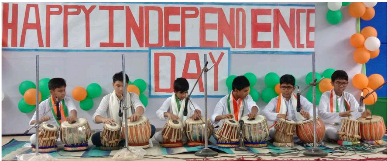
Table performance by Grade 7 & 8

Addressing the audience, the Principal of the school shed the light on the theme of this Independence Day 'Nation First, Always First'. He said how in each phase the nation manifested this theme by dedicating itself towards a special mission. First, in the pre-Independence stage, Nation First became manifested through complete dedication towards freeing the nation from the British rule and in the post-Independence stage, the theme became manifested through complete dedication towards nation-building in the educational sector, agriculture sector, health sector, etc. Now, we are in the 3rd stage, where we should see the manifestation of the theme in a beautiful balance between our spiritual values and advancement in science & technology in our country.